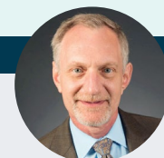
DR. ROBERT WALDINGER Director